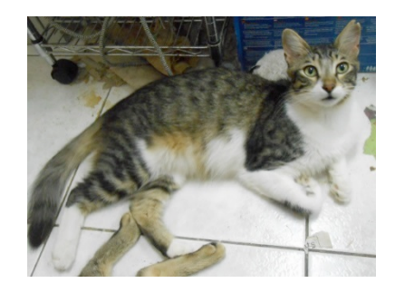
Beau Dandy Genie